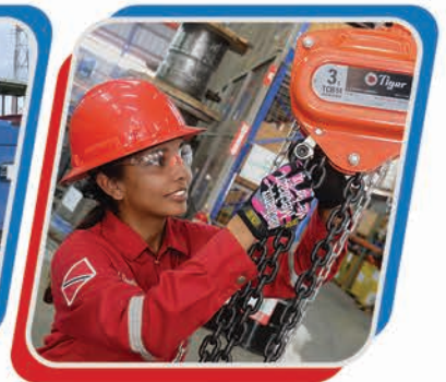
Rigging & Lifting