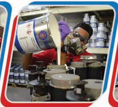
Commercial & Consumer