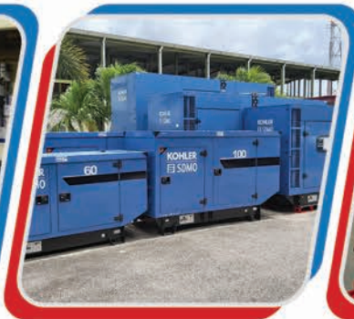
Mechanical & Electrical